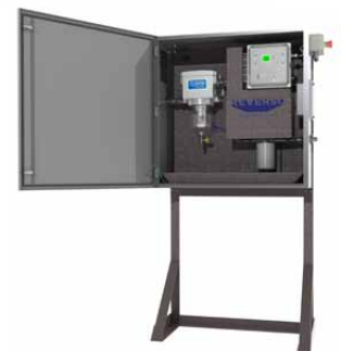
Enclosure with Stand